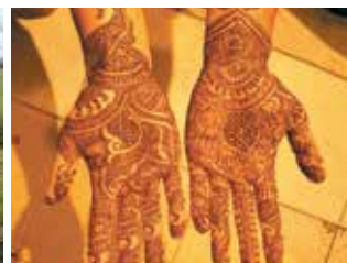
India's original henna tattoo.

The more white hairs you have, the wider your range of color choices for 100% natural henna and herbs.