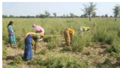
Henna is farmed organically, with the first harvest in September and second in November.