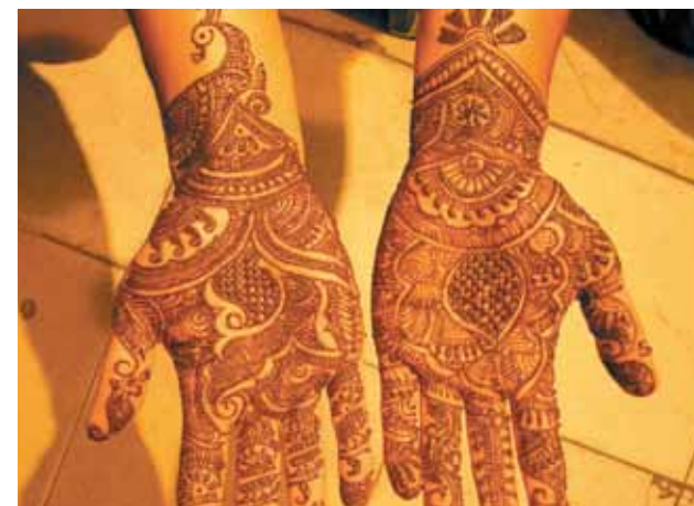
India's original henna tattoo.