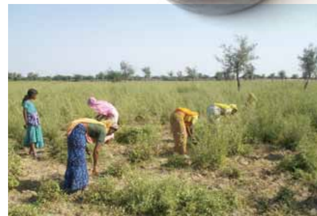
Henna is farmed organically, with the first harvest in September and second in November.